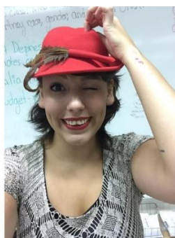
Figure 1: Bunny's Great Depression Lesson

Multimodality is an approach to critical literacy that can include "spoken words, images, music, written text, and movement and transitions" (Hull & Nelson, 2005, p. 234). I began using this approach while teaching freshman English Language Arts at Albuquerque High School. The city library allowed me to check out a traveling trunk full of Great Depression-era artifacts like hats, washing boards, heavy irons, and kitchen items. I also played common songs of the time, including a 1932 song called "Brother, Can You Spare a Dime?" I cooked a treat of cornbread, which was a recipe that stretched thin resources at home to feed hungry mouths. I incorporated these elements into a lesson on the novella "Of Mice and Men" (Steinbeck, 1937) in order to highlight the desperation in times of precarious employment that drives the main characters' behavior on their ranch. I then documented the lesson photographically in order to share best practices and reflect on the successes of my lesson. In sharing, I was engaging in the kind of collaborative conversations that "defy the easy assignation of authorship but also suggest a more egalitarian form of knowledge production" (Collins, Durrington, & Gill, 2017, p. 145). Freely sharing lessons and practices on social media is essential in efforts to decolonize those classrooms that make teachers their central sources of pedagogical knowledge and expertise.