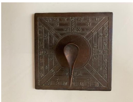
Figure 1: Model of a Chinese Compass During Han Dynasty